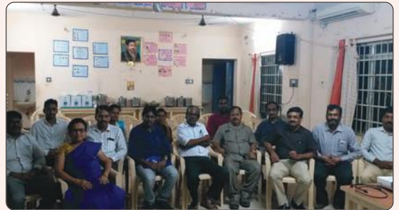
IMA Nidamangalam Mannargudi