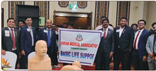
IMA Chennai Tambaram