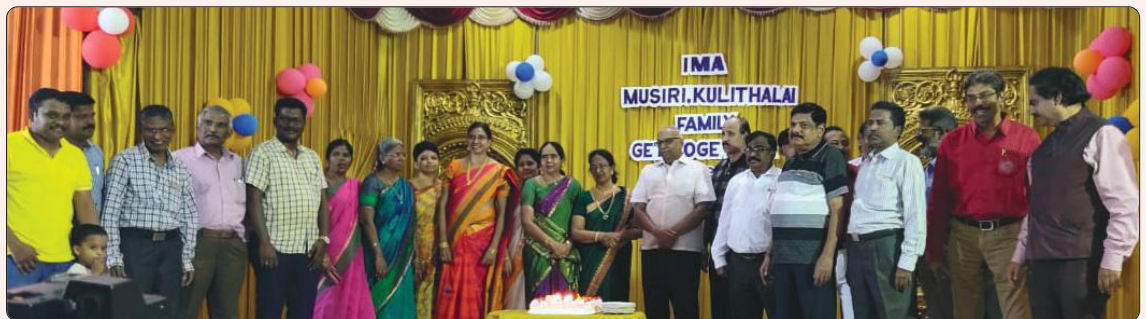
IMA Musiri Kulithalai