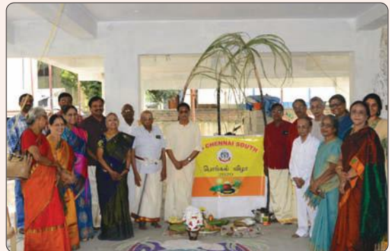
IMA Chennai South