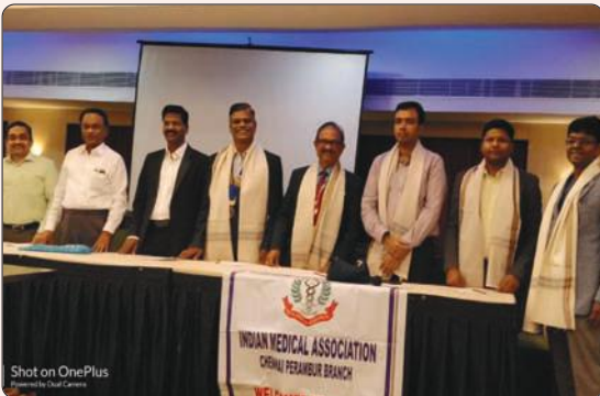
IMA Chennai Perambur