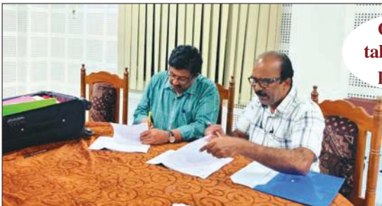
Official taking over process