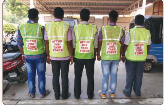
IMA Attur TASK Force