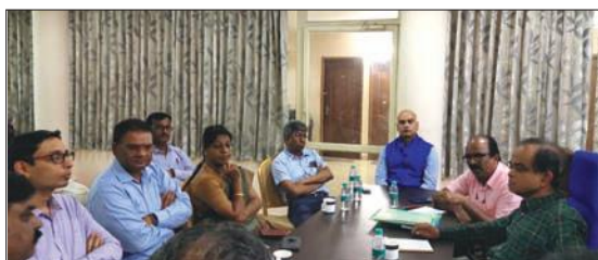
Chennai Corporate Hospitals Meetings