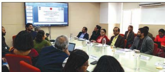
All India State President Meet with Union Minister for Health