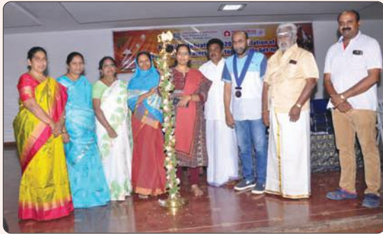
IMA Mullai Periyar