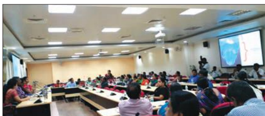
Pulse Polio Campaign 2020