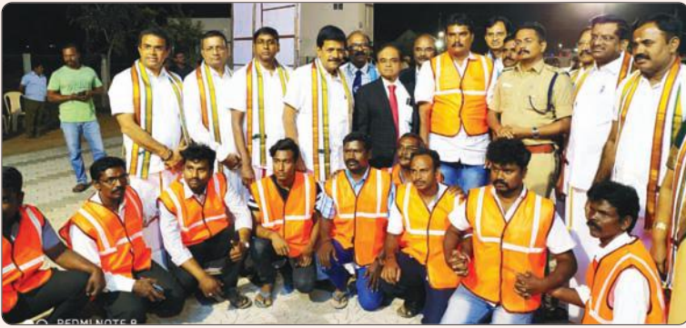
IMA Tirupur - TASK Force