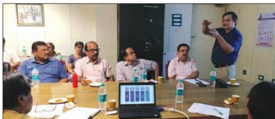
Official Meet with DPH