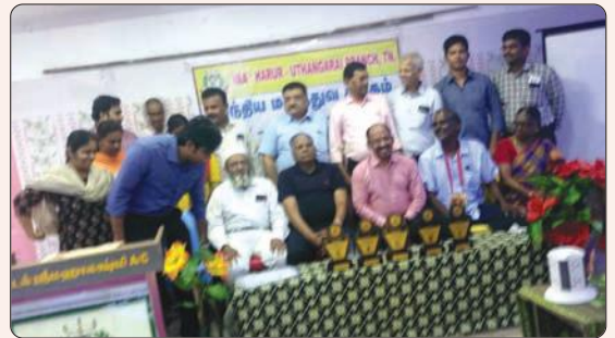
IMA Harur - Uthangarai