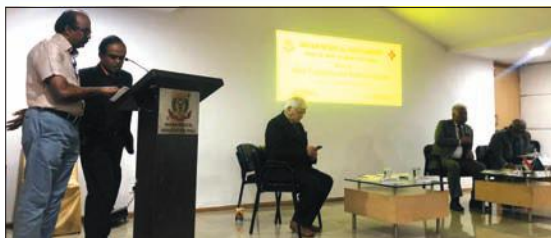
State President & State Secretary Meet at New Delhi