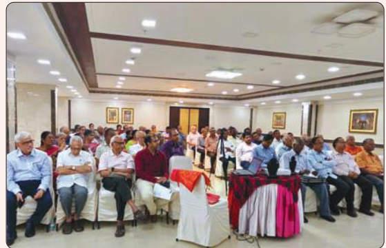
IMA Chennai Kodambakkam