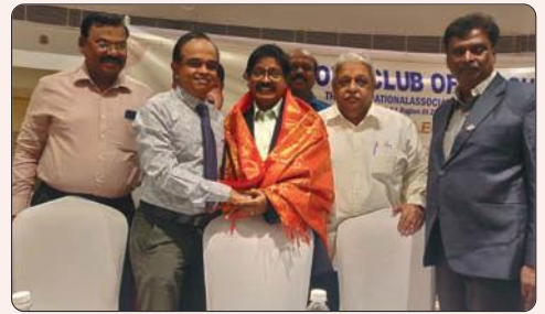
IMA Chennai City