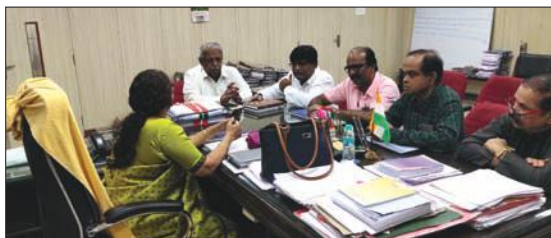
Official Meet with DMS