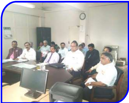
Meeting with Commissioner of Labour