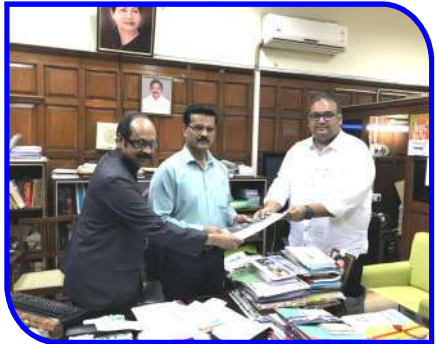
Meeting with Assembly Secretary