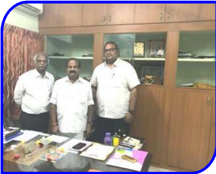
Meeting with Environment Minister