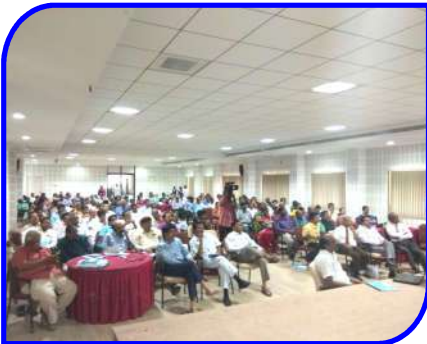
Brain Storming Session