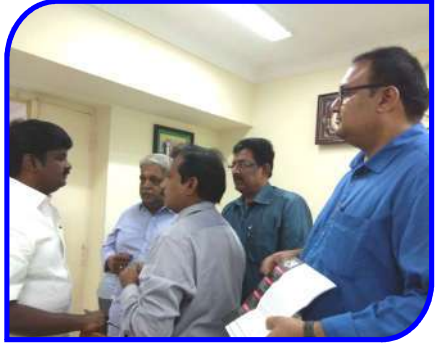
Meeting with Health Minister