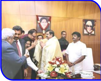
Meeting with Honorable Chief Minister