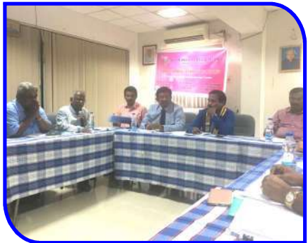
Executive Committee Meeting