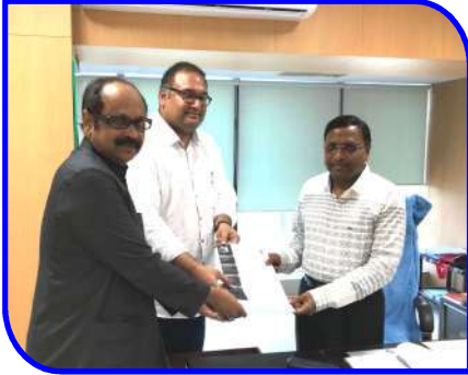
Meeting with Past Labour Commissioner