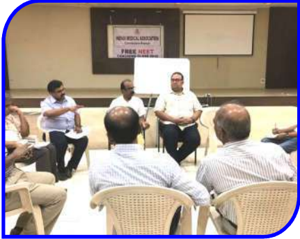
Cost Analysis Meeting