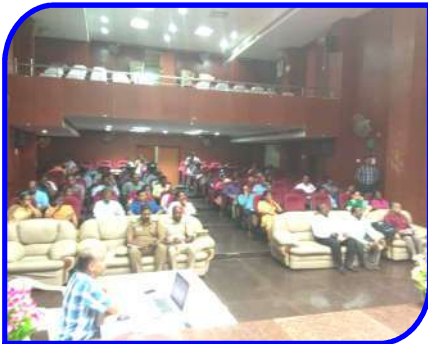
Fire Safety Meeting with officials and JD's